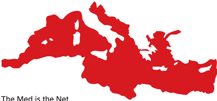
The Med is the Net